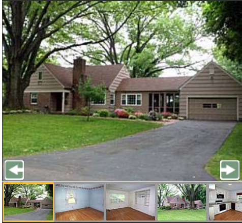
Photo Gallery Guided Tour